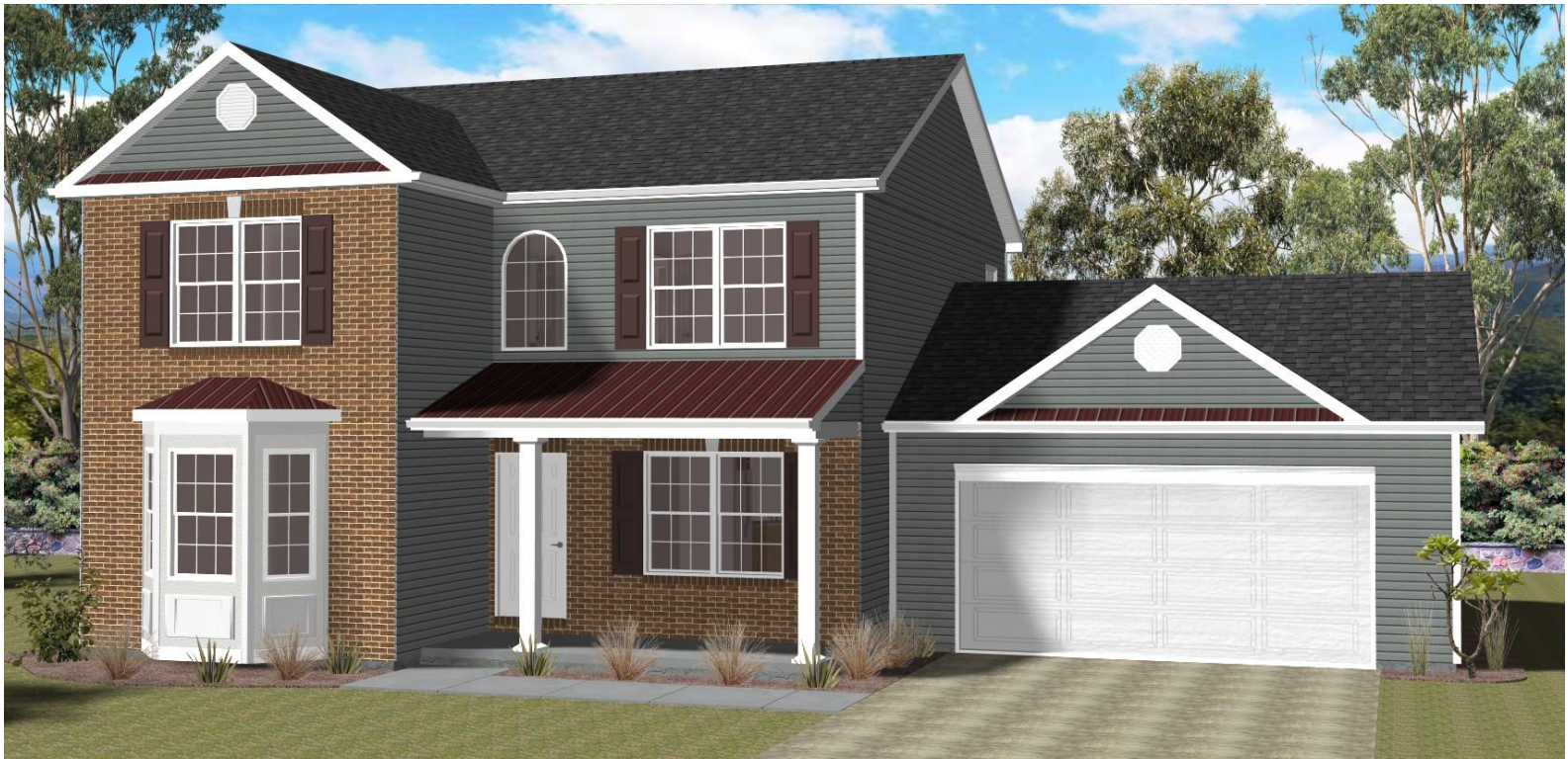
52' X 43' - 3 BEDROOM - 2 1/2 BATH (APPROX. 1963 HEATED SQ. FT.)