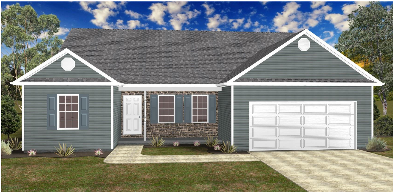
52' X 50' - 3 BEDROOM - 2 BATH (APPROX. 1803 HEATED SQ. FT.)